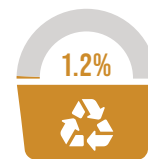
LATIN AMERICA AND THE CARIBBEAN